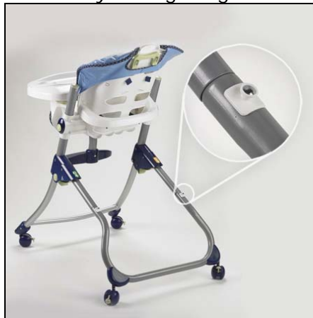
Close to Me™ High Chair With Tray Storage Peg