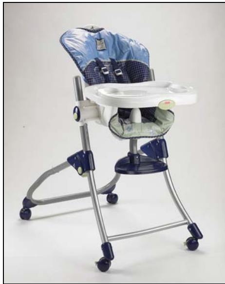
Close to Me™ High Chair