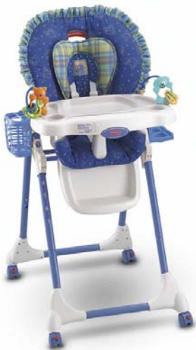
Healthy Care™ High Chair