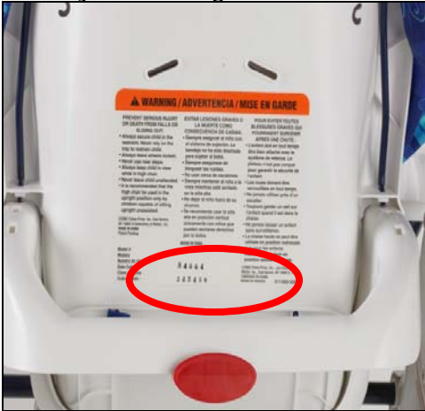
Healthy Care™ High Chair